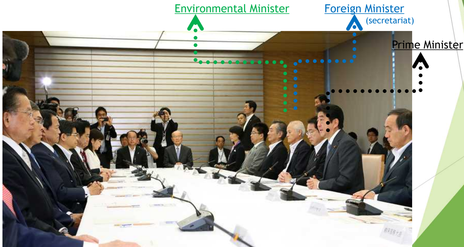
The 3rd SDGs Promotion Headquarters Meeting (June 2017) (Cabinet Public Relations Office)